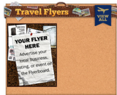
Local display advertising by PaperG

Listed by TRAVELZOO *Some taxes, fees additional