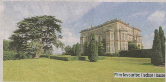
Film favourite: Hedsor House