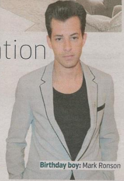
Birthday boy: Mark Ronson

From £5,450, including house hire for event and overnight accommodation for up to 22 people sharing double rooms (working out at £248 per person), hedsor.com