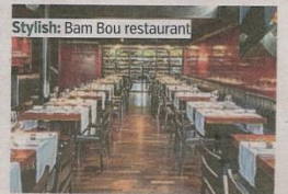
Stylish: Bam Bou restaurant

From £239 per room per night, the-hotel.ch