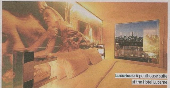
Luxurious: A penthouse suite at the Hotel Lucerne