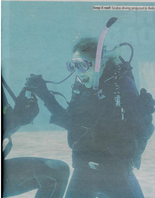
Keep it reef: Scuba-diving proposal in Belize

has also put together a portfolio of 'experience' categories to help those needing inspiration.