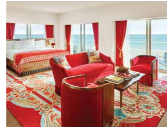
CLOCKWISE FROM LEFT: Private Reserve, Gili Lankanfushi, Maldives; The Faena Suite, Faena Hotel, USA; Ty Warner Suite, Four Seasons New York; Space Suite, Kameha Grand Zurich, Switzerland.