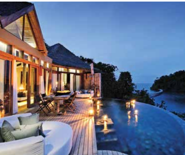
CLOCKWISE FROM TOP LEFT: Casa Laguna Villa, Rosewood Mayakoba; The Lanesborough Royal Suite; Grand Riad, Royal Mansour, Morocco; Reverie Romance Suite, Ho Chi Minh City; Presidential Suite, Park Istanbul; Royal Villa, Song Saa, Cambodia.