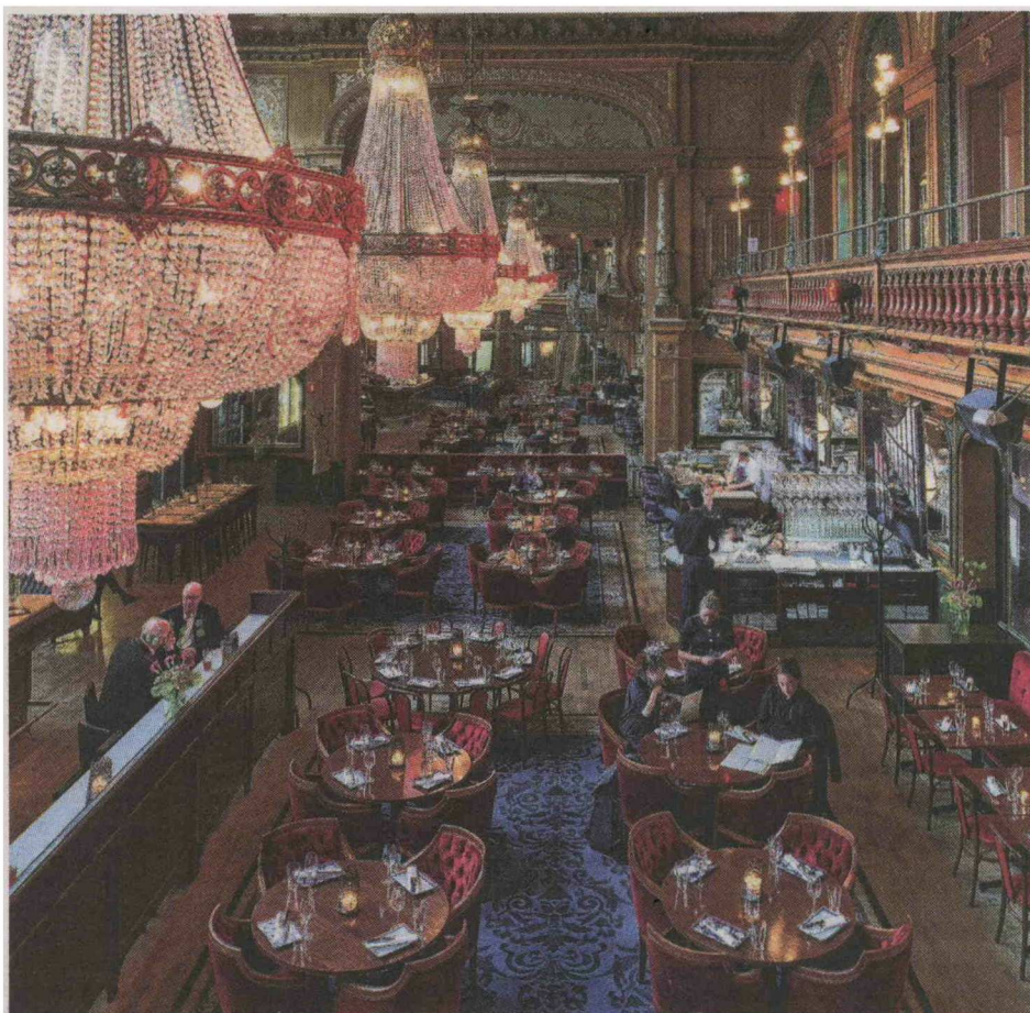
The public spaces of the Berns Hotel, Stockholm are pure Gustavian splendour, while the bedrooms mine a more contemporary Scandi chic