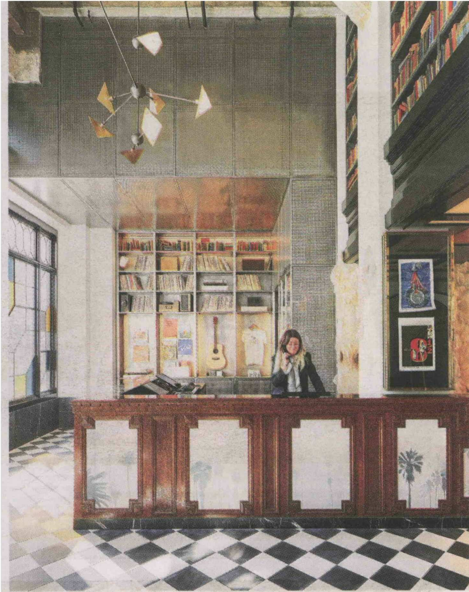
Clockwise from above: Classic checkerboard tiles fill the floor of the double height lobby of the Ace Hotel in downtown LA; Italian-style mid century velvet sofas and op-art rugs create a home-away- from-home at London's Hospital Club. Designed by artist Michael Najjar, this floating bed in the space suite at Kameha Grand Zürich is out of this world; The Loft restaurant at Vienna's Sofitel Stephansdom, designed by Jean Nouvel features a video paneled ceiling by Swiss artist Pipilotti Rist.

Source: Irish Times (Magazine) Edition: Country: Republic of Ireland Date: Saturday 31, October 2015 Page: 16,18 Area: 1182 sq. cm Circulation: ABC 82059 Daily Ad data: page rate £21,586.00, scc rate £69.40 Phone: 00 353 1 675 8000 Keyword: Kameha Grand Zurich