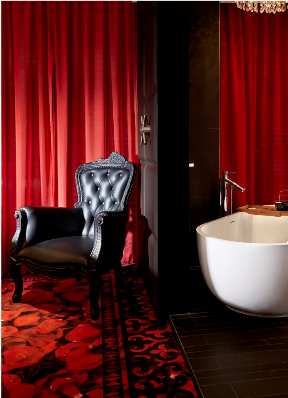
Kameha Zurich Burlesque Suite