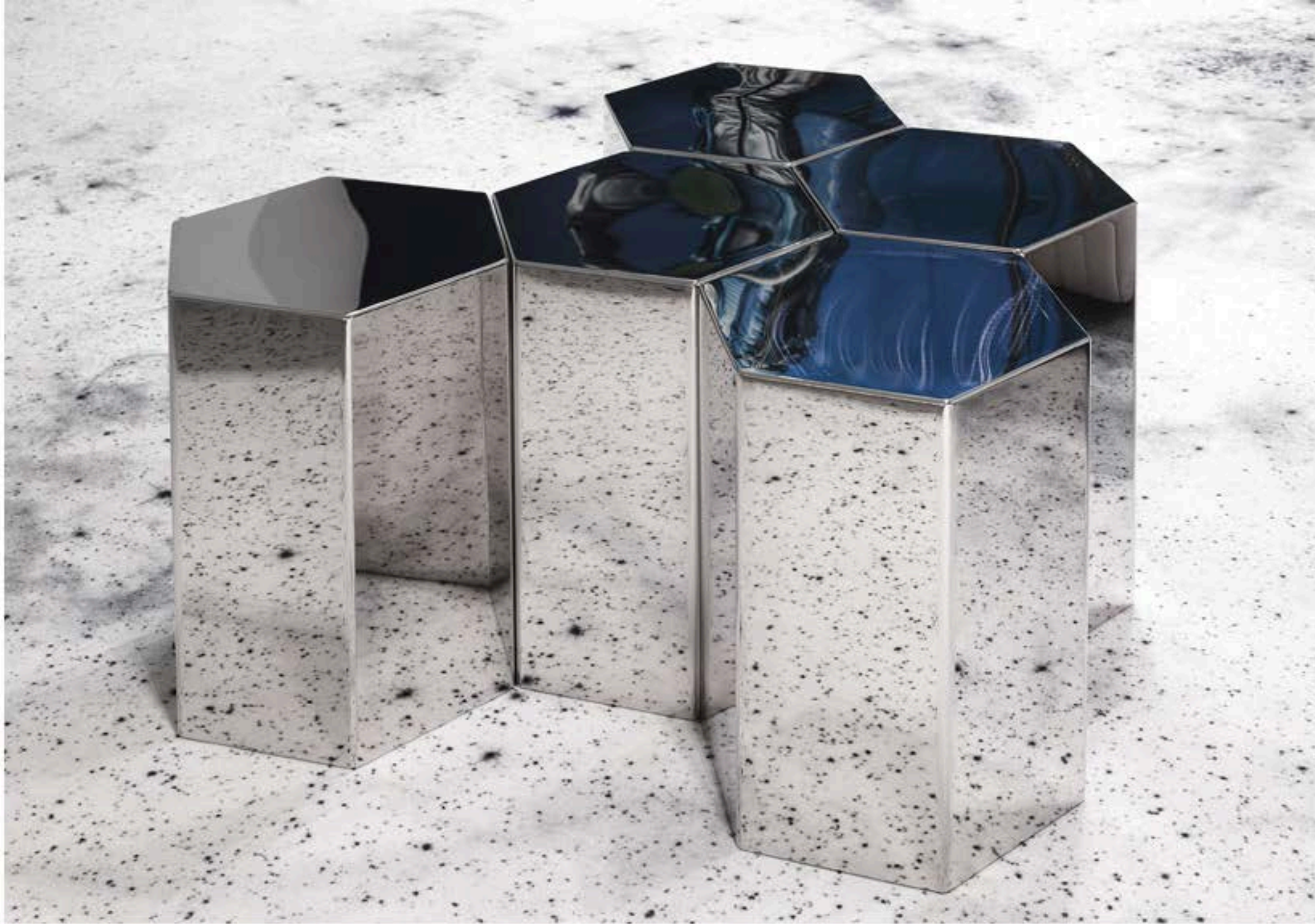
a mirrored, geometric table is situated atop the monochromatic universe carpet