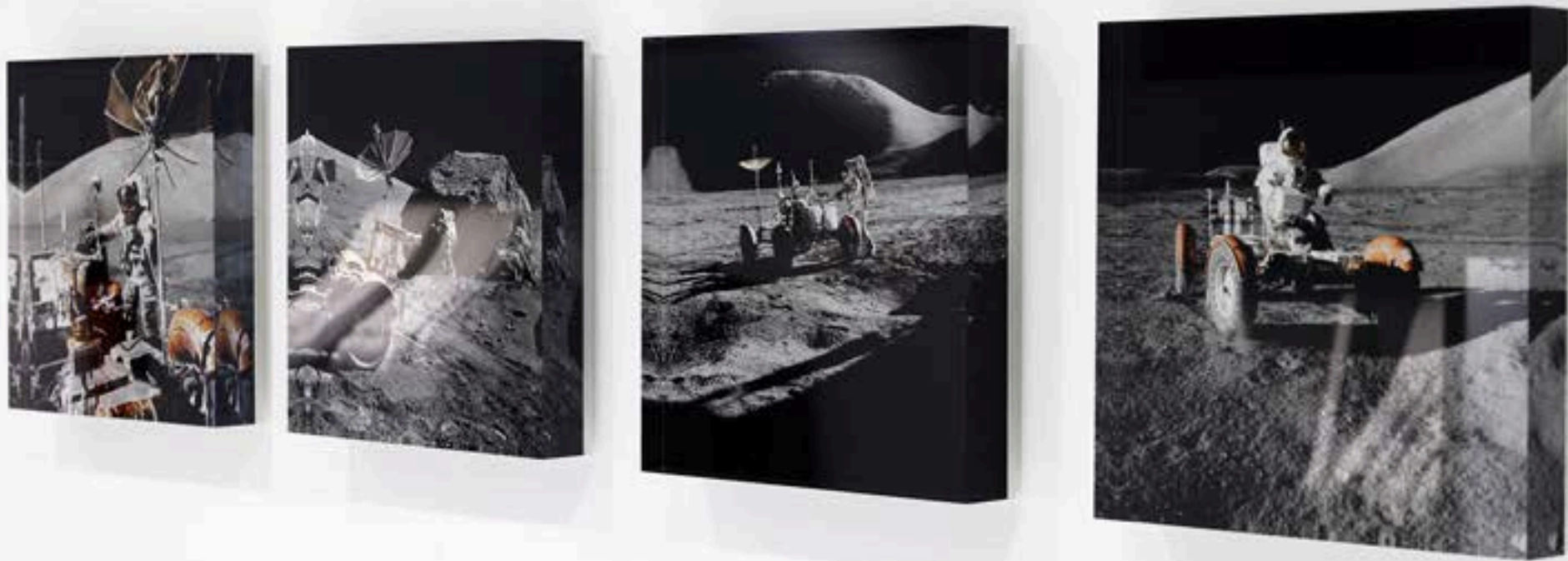
pictures of lunar rover and astronauts from apollo 15, 16 and 17 are installed in the dressing room