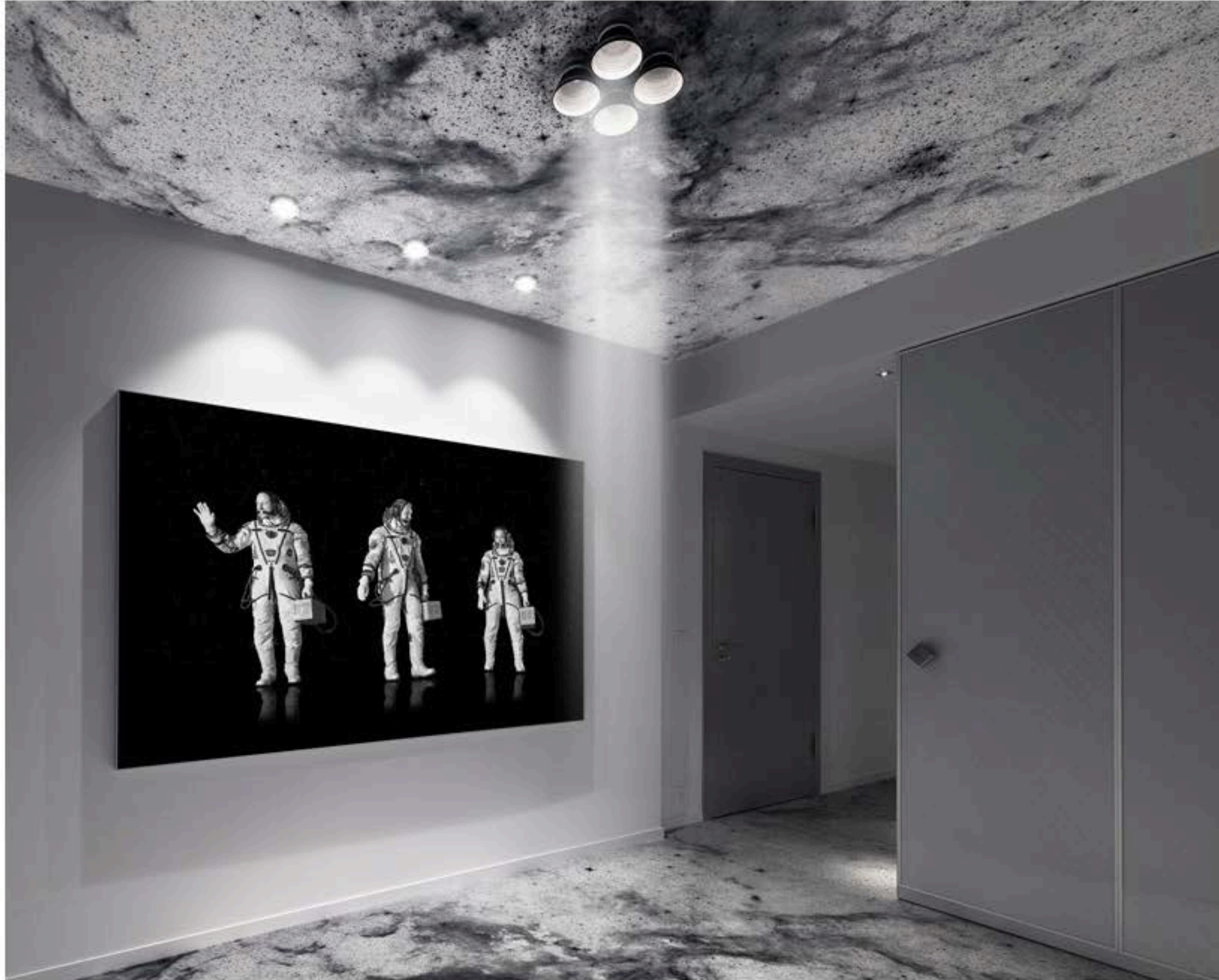
the bedroom is canvassed with a semi-transparent foil that blocks visibility to the outside but allows light to enter