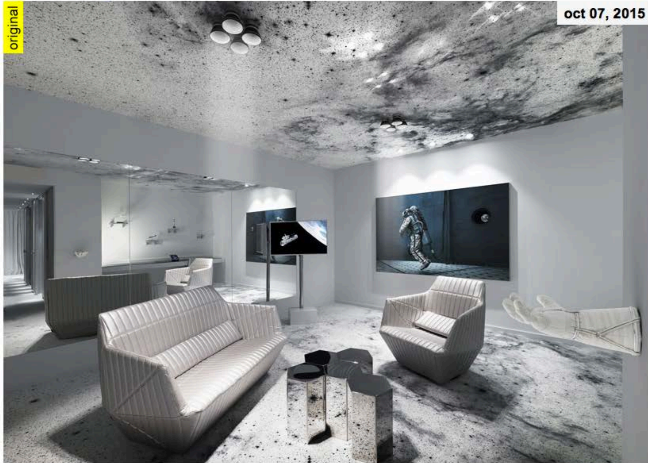
artist-designed space suite immerses guests in an out-of-world experience