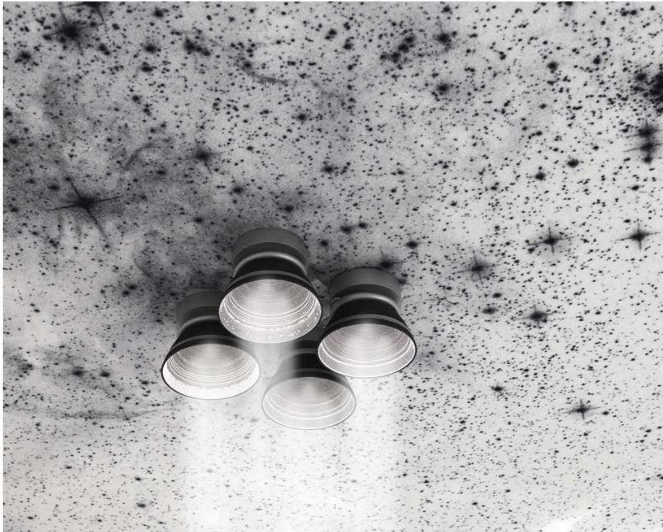
a 3D printed rocket engine spot light illuminates the living room

artwork by najjar added to the suite interior includes 'liquid gravity', a piece that explores linkages between space, gravity, and the human body; portraits of the space crew of TMA-14M, which left earth in a soyuz spaceship in september 2014 for 'space voyagers'; and the video work 'orbital cascade_57-46', which visualizes the quantity of defunct objects in orbit around the earth from 1957 to 2046.