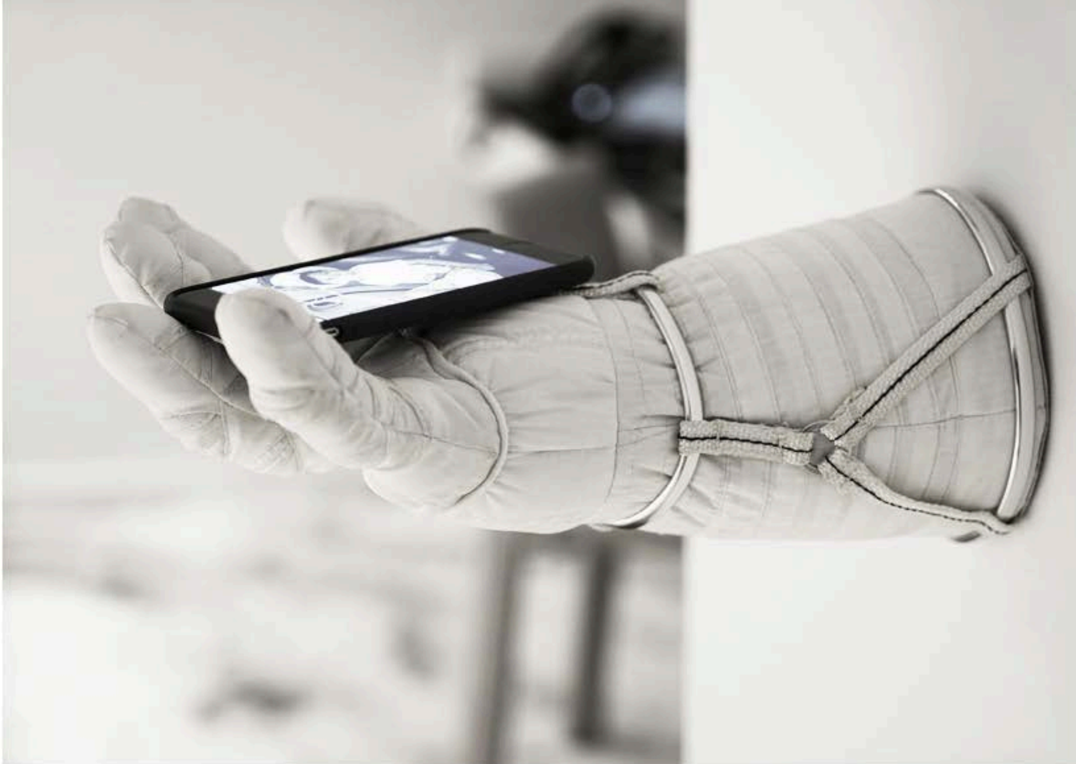
a space glove, where guests can place their phones or key cards, protrude from the wall