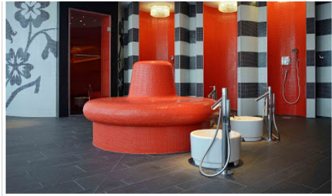
Have a steam bath