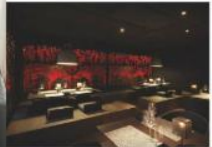
Look out for design touches that nod towards the hotel's roots, such as Tolson-style sofas and cowbell lamps